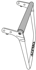
B - (1 pcs.)